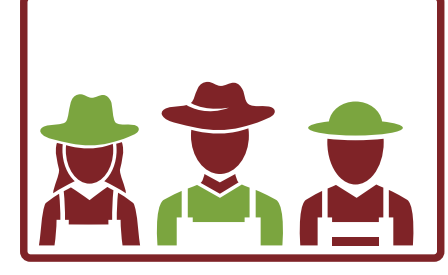
LOSS OF BIODIVERSITY